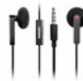
Lenovo On-Ear-Headphones 4XD0J65079