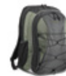
Lenovo Performance Backpack 41U5254