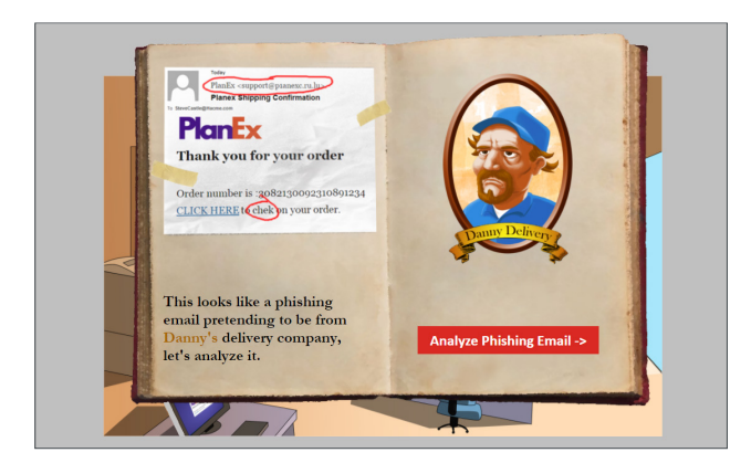
Engage users with a selection of interactive training modules

Over 30 interactive training modules will educate users about specific threats such as suspicious emails, credential harvesting, password strength, and regulatory compliance. Available in a choice of nine languages, your end users will find them informative and engaging, while you'll enjoy peace of mind when it comes to future real-world attacks: