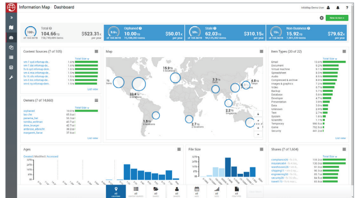
Figure 2. Veritas Information Map integration renders your information environment in visual context and guides users towards unbiased, information-governance decision making.

Backup Exec's integration with Veritas™ Information Map renders your information environment in visual context and guides users towards unbiased, information-governance decision making. Using the Information Map's dynamic navigation, customers can identify areas of risk, areas of value and areas of waste across their storage environment and make decisions which help reduce information risk and optimize information storage.