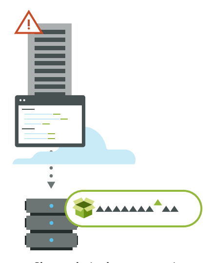
Choose desired recovery point