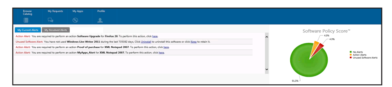
Figure 2: My Apps offers employees one place to view how applications installed on their devices comply with corporate policies and to participate in Software License Optimization.

Simplified Application Management — A wizard simplifies the publishing of items in the app store. Add software, hardware and security group provisioning and specify the attributes to be included with each application, such as the approvals required and whether deployment is to be immediate or scheduled. To simplify the request process, items can be bundled and presented as a single item.