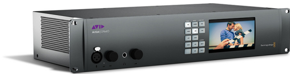
Capture, monitor, and accelerate SD, HD, UHD, 2K, and 4K editing with an Artist | DNxIO interface.

For the latest Media Composer requirements, qualified systems, and configuration guidelines, please visit www.avid.com/MCreqs .