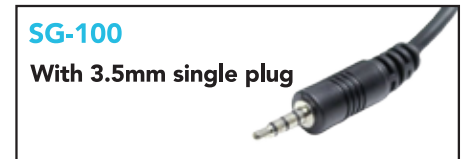
SG-100 With 3.5mm single plug