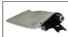
Includes Travel Bag