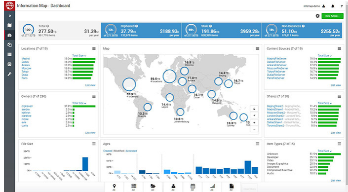
Figure 4. Veritas Information Map renders your information environment in visual context and guides users towards unbiased, information-governance decision making.