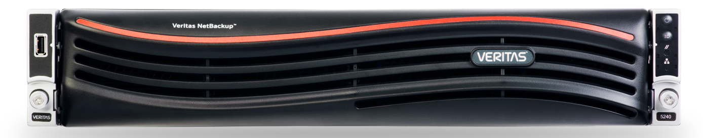
Figure 2. Veritas NetBackup™ 5240 is an integrated enterprise backup appliance with expandable storage and intelligent deduplication.